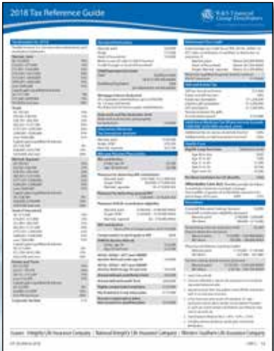
Tax Reference Guide