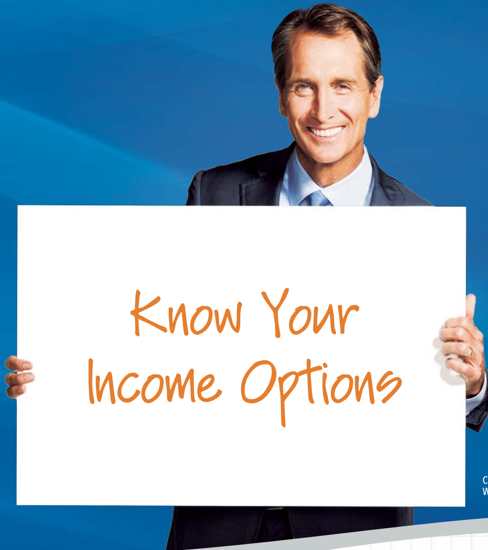
Cris Collinsworth Western & Southern Spokesperson

Put Your Retirement Income Plan in Action