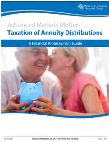
Taxation of Annuity Distributions