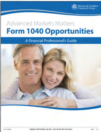
Form 1040 Opportunities