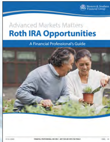
Roth IRA Opportunities

Get Yours Today from Your Regional Representative