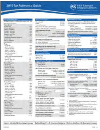
Tax Reference Guide